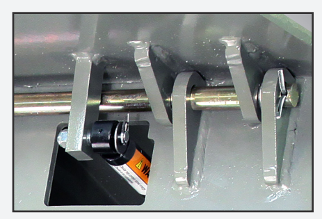
"Box construction" deck with a heavy duty lug hinge design.