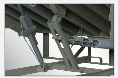
Cam Control Counter Balance Assembly permits smooth ramp extension and easy walk-down of the leveler.