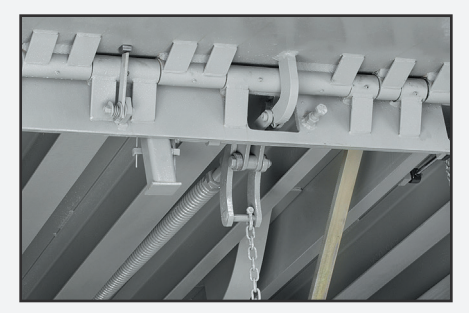
The Lip Drive positive lip extension reliably extends the leveler's lip and restricts its descent until walk-down is performed.