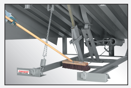
CleanSweep Frame allows unobstructed access to the pit area.